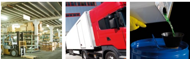
* The B-EX4T2 was benchmarked against competitor products in stand-by mode.